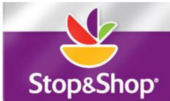
4% to Maimo PTA