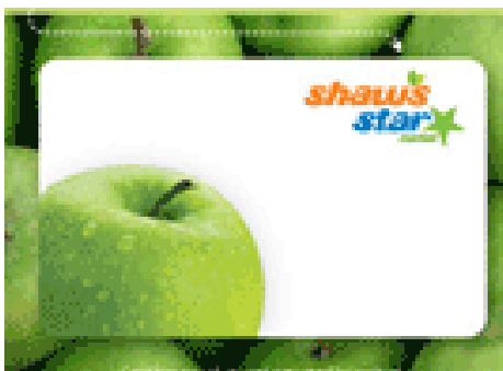
4% to Maimo PTA

AT NO EXTRA COST TO YOU... ...YOU PAY FACE VALUE FOR ALL CARDS!!!!